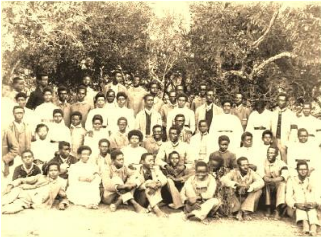
Oromo's Liberated Slaves in Lovedale South Africa: Photo: South Africa National Archives.

both sexes were given education and also training in various industries such as farming and printing. At the beginning Lovedale had both white and black pupils but this was ended in 1896. 17 That change was the early sign of apartheid. In 1889 Lovedale received its first batch of Liberated Slaves originating from the Oromo land near Abyssinia from the overcrowded camp in Aden. They arrived on 20 th August, 1890 at East London on the Conway Castle . There were 22 girls and 42 boys all very young Oromos around the age of 8 or 9 years.