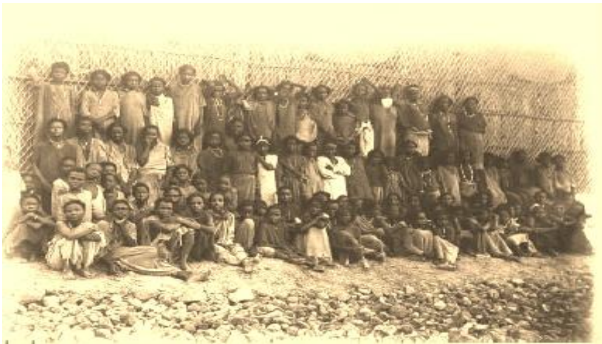
Oromo liberated slaves in Aden: Photo: Cory Library: South Africa National Archives

But their campsite was not ideally located in the harbour and was known as Slave Island (Swaya Island). Little is known about their fate or if they were taken up by local families. Some were employed at the port, before being transferred to Bombay. In 1886, another camp for the liberated Africans was opened at Sheith Othman an oasis near Aden, by Ion Grant Keith-Falconer. He was an athlete, Arabic scholar, a Scottish missionary of Free Church of Scotland. In 1889, Slave Island with its lack of facilities was getting too crowded with the incoming of Liberated Slaves. Britain's main concern was to find alternative home for the child slaves. They decided to send liberated Africans from Aden to the Lovedale Presbyterian Mission in South Africa.