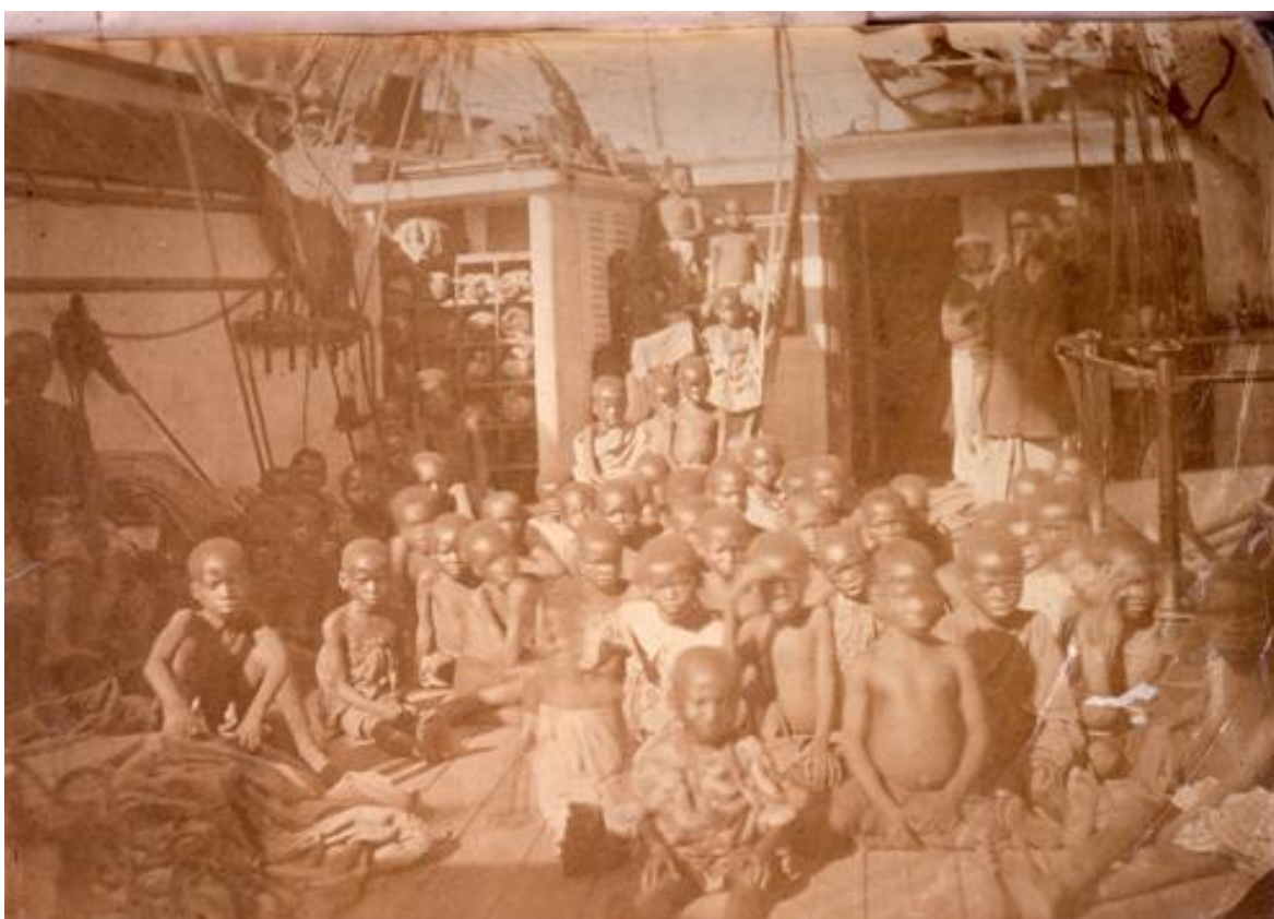
Slave rescue off East Africa by HMS Daphne.

In 1822, Britain started to eradicate Arabic slave trade in the Indian Ocean. In September of the same year a treaty was signed by Captain Fairfax Moresby 15 of the Royal Navy and Sultan Seyyid Said and it was known as the “Moresby Treaty”. That treaty forbade the sale of slaves to Christian traders from all ships plying from Zanzibar Sultanate south of Cape Delgado, or east of line from Gujarat to Socotra. Later more treaties were signed to make it easy to enforce the stoppage of this illegal trade. They were the Hamerton and the Anglo-Omani treaties which prohibited slave trading between Zanzibar and Oman.